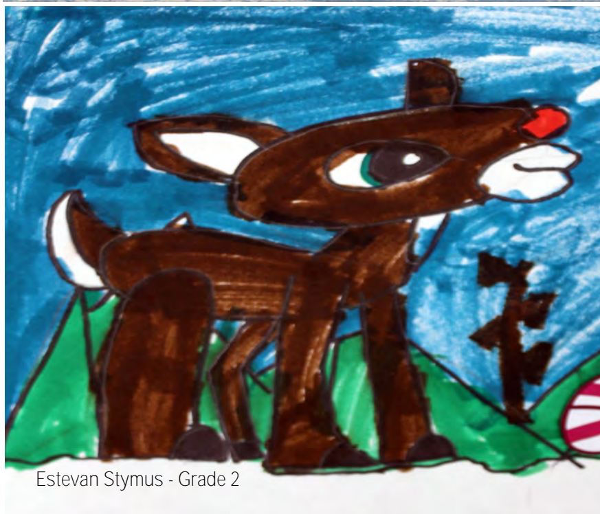
Estevan Stymus - Grade 2