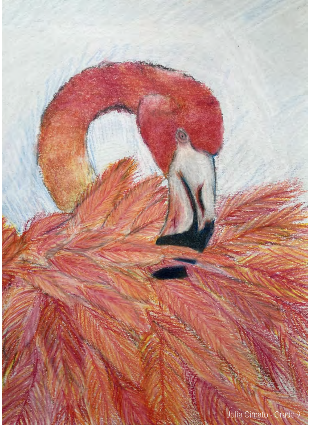
Julia Cimato - Grade 9