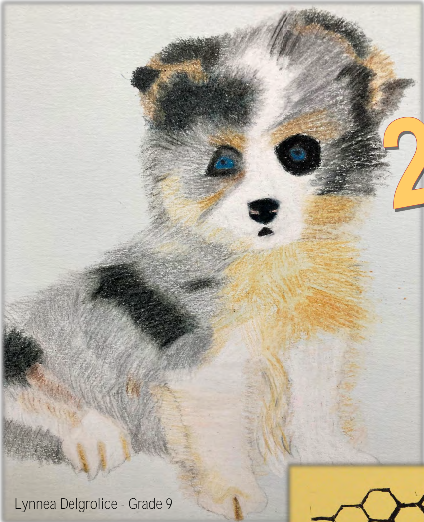
Lynnea Delgrolice - Grade 9