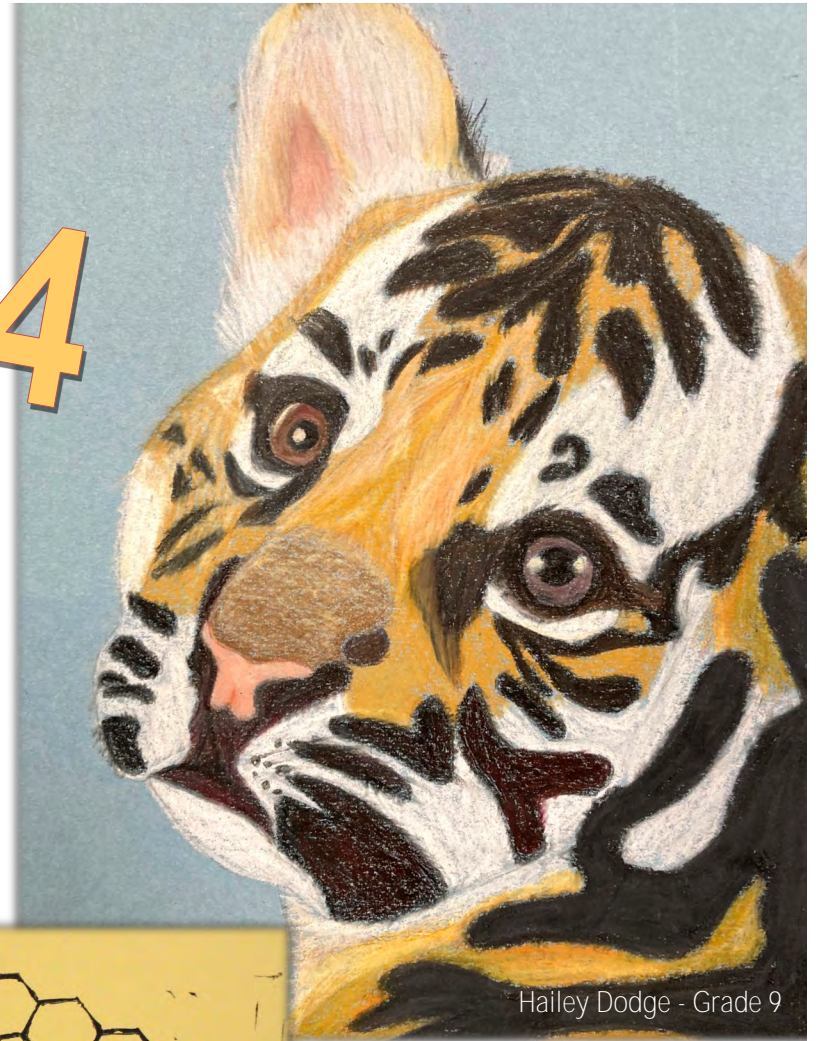
Hailey Dodge - Grade 9