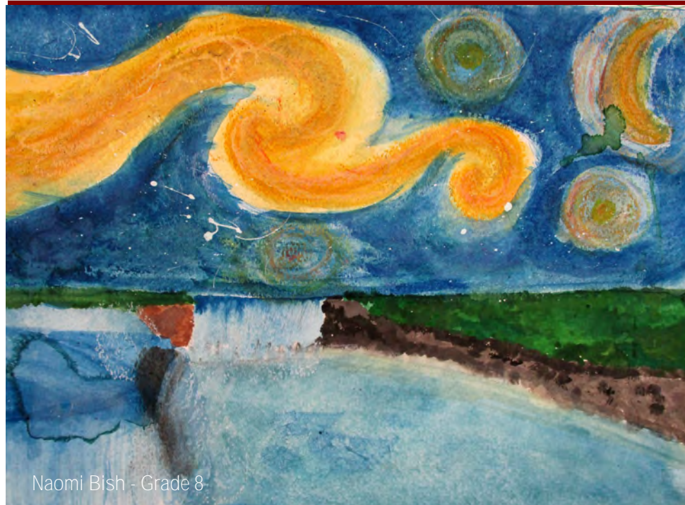
Naomi Bish - Grade 8