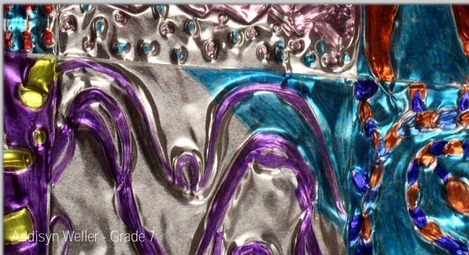
Addisyn Weller - Grade 7