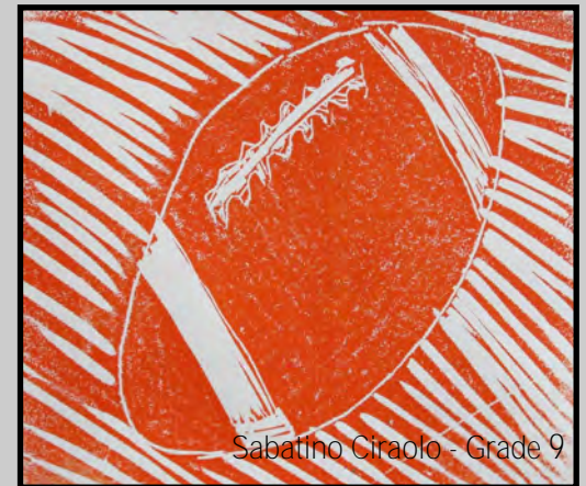
Sabatino Ciruolo - Grade 9

Michaela Love, Principal Barker Central School 1628 Quaker Road Barker, NY 14012 716-795-3350