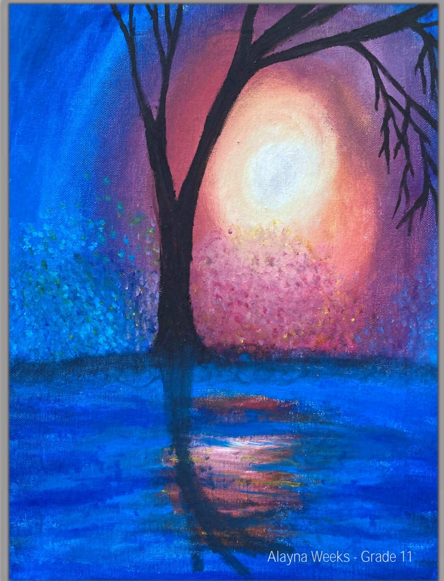
Alayna Weeks - Grade 11