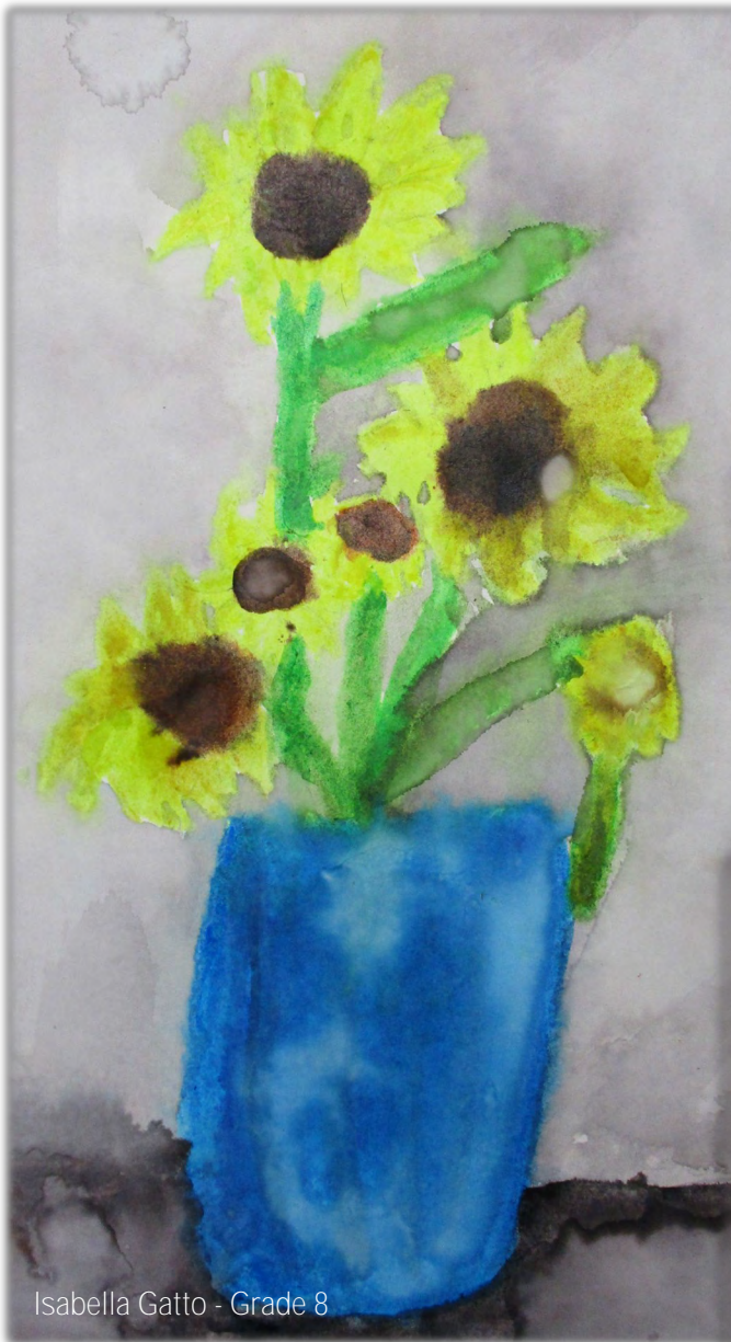
Isabella Gatto - Grade 8