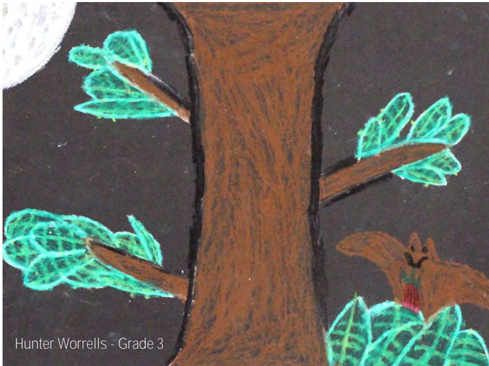
Hunter Worrells - Grade 3