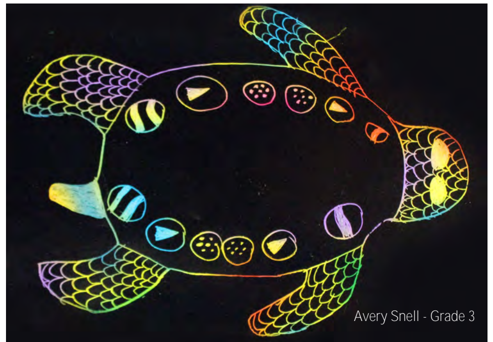
Avery Snell - Grade 3