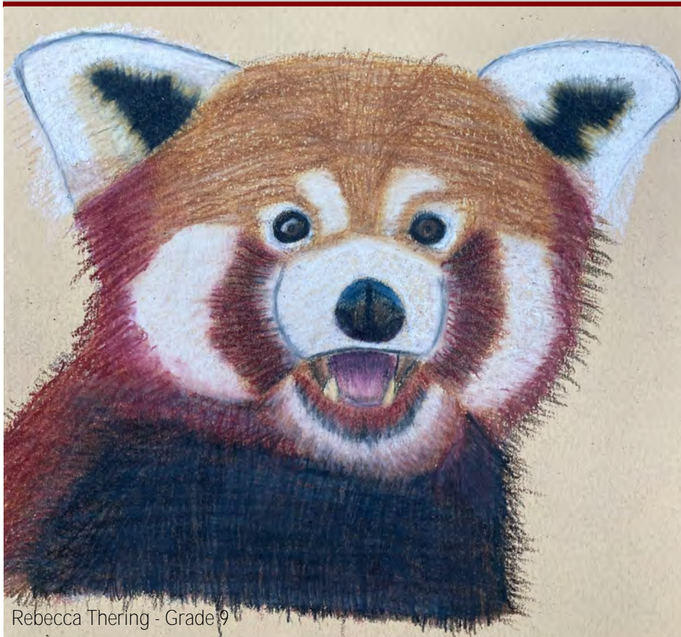
Rebecca Thering - Grade 9