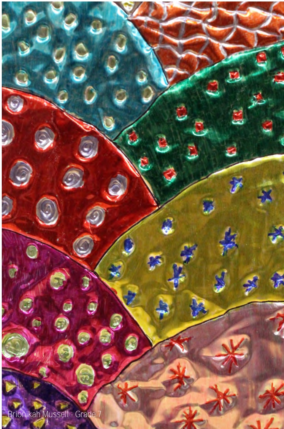
Brionikah Mussell - Grade 7