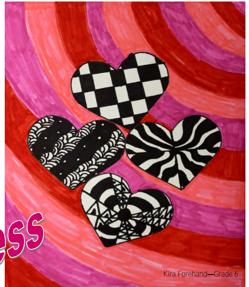
Kira Forehand—Grade 6