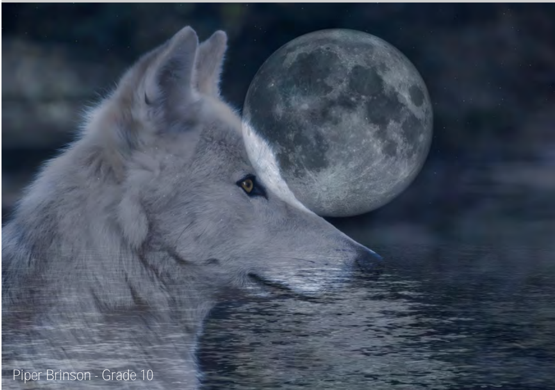
Piper Brinson - Grade 10